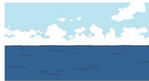
sea or ocean