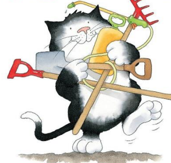
Nick Butterworth and Mick Inkpen